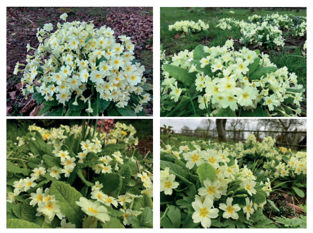
TIPS FROM CLEEVE NURSERY

If you haven't done it already, prune Buddlejas back to about waist height and trim Lavateras [Tree Mallows] back to healthy new shoots.